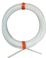
PE tube 6mm