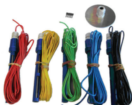
Level Sensor Set